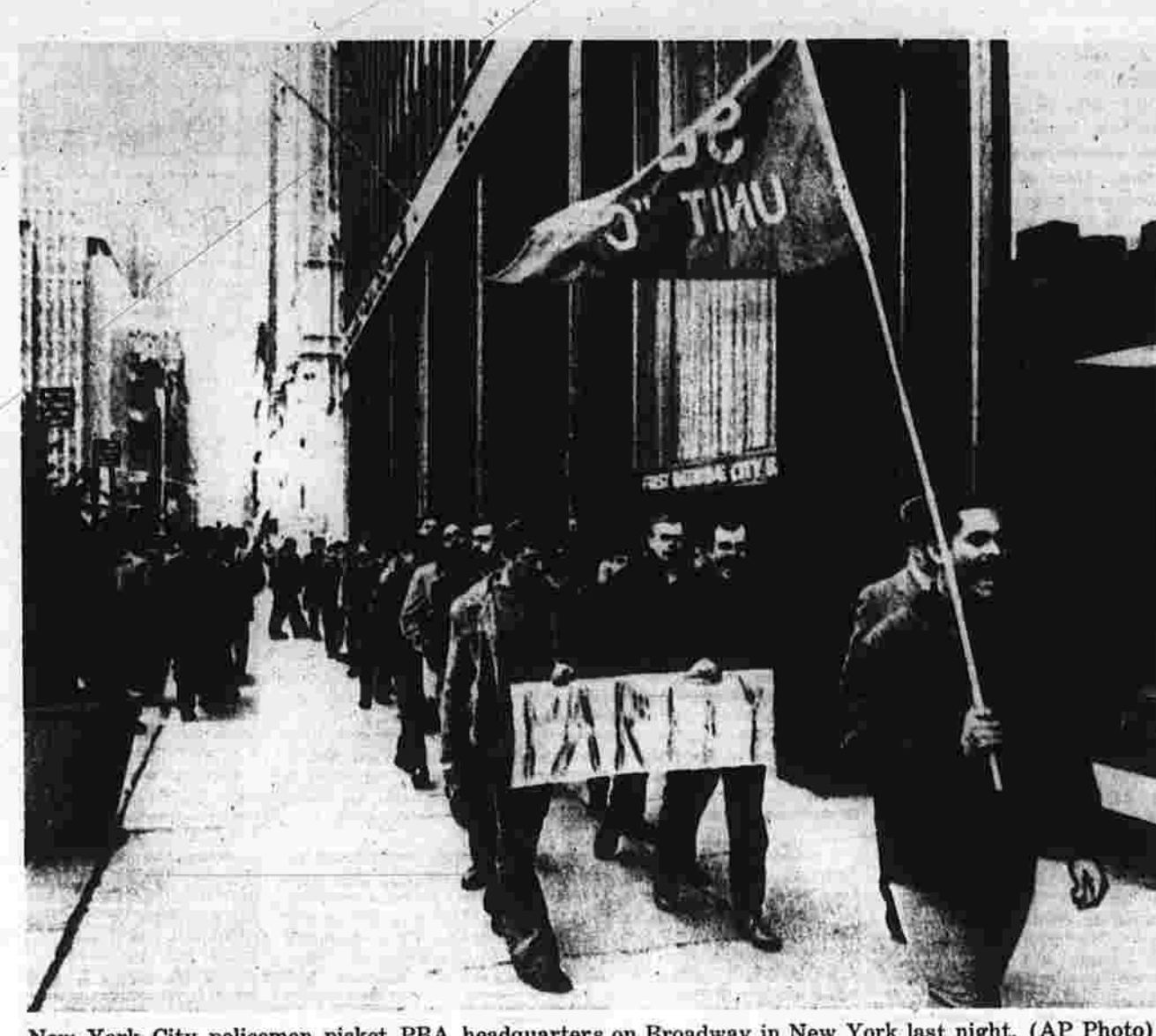
New York City policemen picket PBA headquarters on Broadway in New York last night.