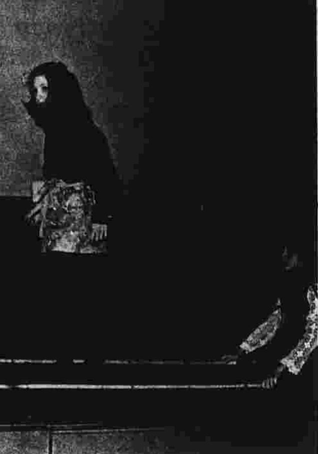
Dancing in Philippine Style